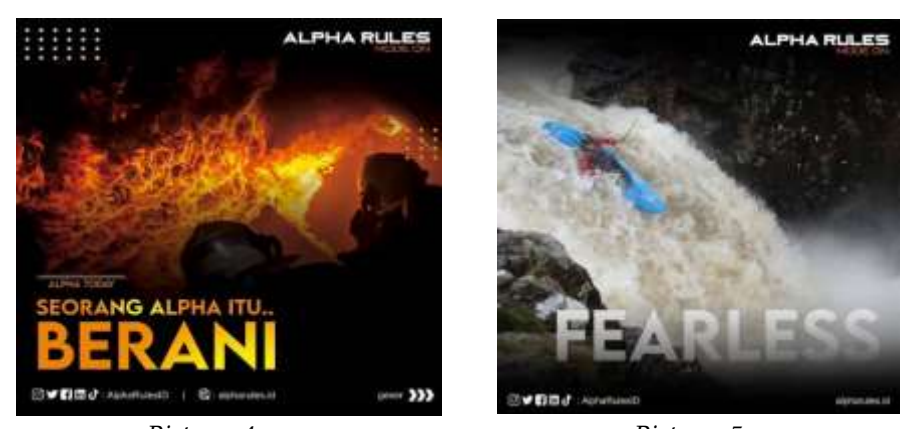
Pictures 4 Pictures 5

Both pictures show the simple phrase with the product's main message, masculinity. Looking at both pictures as advertisements, we may be focusing our discussion on the activity portrayed in the picture. Both activities in the picture might be categorized as a masculinity massage. All activity that triggers people's adrenaline, such as rafting, is mainly done for men. As a result, we interpret the activity in the picture to have a masculine message. Then, by considering the use of language in both pictures, it may also be categorized as a masculinity aspect. With the word " berani " in picture 1 and " fearless " in picture 2, we may assume those words may belong to the men.